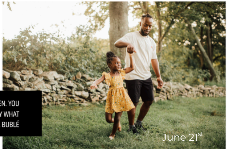
June 21 st

"[FATHERHOOD IS] THE GREATEST THING THAT COULD EVER HAPPEN. YOU CAN'T EXPLAIN IT UNTIL IT HAPPENS; IT'S LIKE TELLING SOMEBODY WHAT WATER FEELS LIKE BEFORE THEY'VE EVER SWAM IN IT." —MICHAEL BUBLÉ